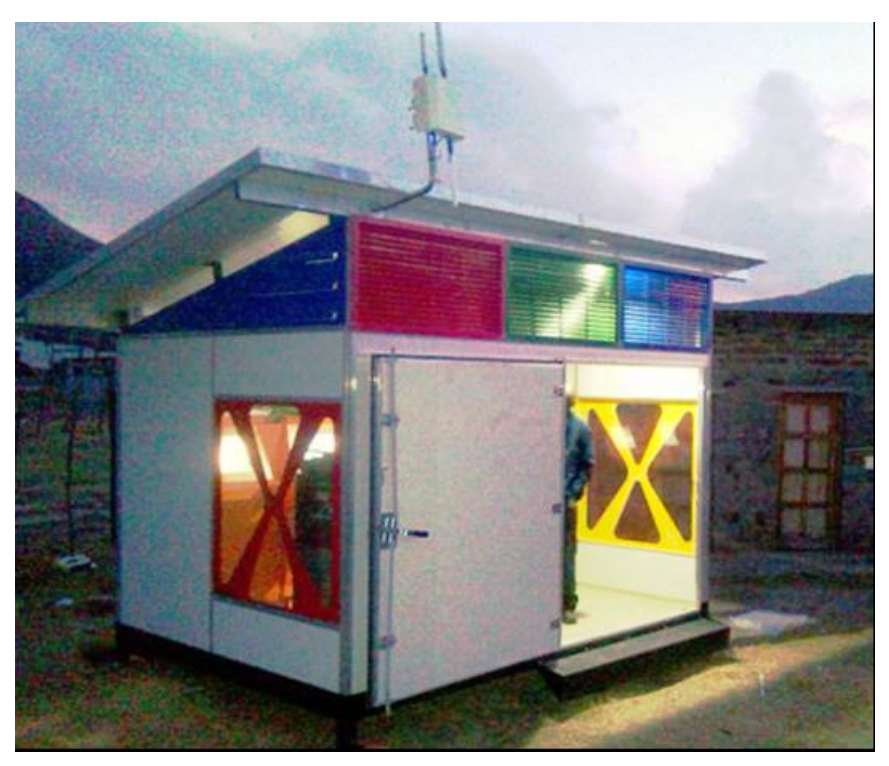
Fig. 1: The solar powered container Platform

The solar container Platforms (Platform) consists of the solar-powered housing (as in Fig.1 above) and ICT Platform (Fig.2 above) which provides people access to computers, mobile tablets and Wi-Fi. The accessories to the Platform included printers and photocopier. The Platforms had both cached, 90 Gigabytes of content and direct Internet in public places with the purpose of offering free 24-hour access to the technology to underserved, poor populations (Stillman et al., 2012). The content available on the Platform includes educational resources which provides user with a variety of educational resources such as: Physics Education Training, simulations, past exam papers, Thutong education portal, Motion Mountain physics textbook, Paul's Maths, Professor Weissman maths, Astronomy, Space Technology and a link to Mindset Videos, books on among others Agriculture, cookbook collection etc. The container Platform's content is accessible without connecting to the Internet but by directly engaging with the ICT terminal or via Wi-Fi enabled devices such as a tablet, laptop or smartphone (Walton & Johanson, 2012). Importantly, at the heart of any well functioning ICT Platforms are the champions.