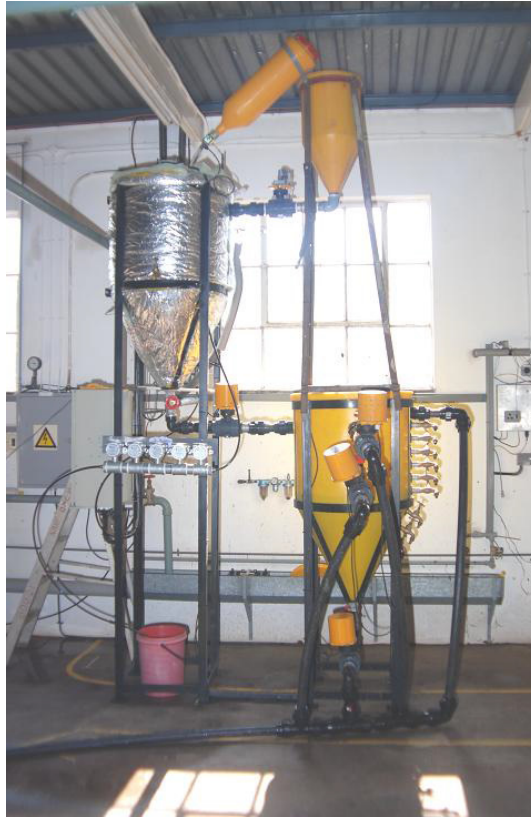
CSIR Design – Wastewater treatment