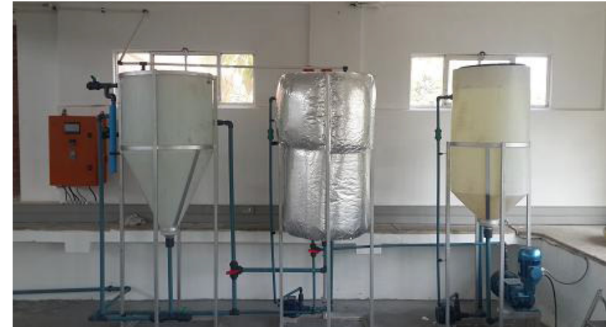
Modified CSIR design (ETM Pilot Plant)