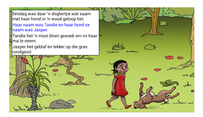
Figure 1: Screenshot of the application in eBook mode.

Activities 1 and 2 consist of a succession of pages that allow different levels of interaction with the content. Activity 1 allows the user to select the text in order for it to be read aloud by the TTS function, while sentences are highlighted as they are read. Activity 2 is similar, but allows the user to touch the characters on each page to hear additional information about them.