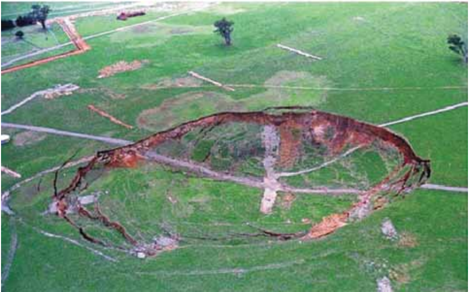
Figure 4.3 Collapses associated with subsurface fires in old abandoned coal workings

When coal is exposed to oxygen it can ignite spontaneously – both in situ coal (for example, in existing or old workings) and stockpiled coal are susceptible to SPONCOM. There is a need to detect and delineate subsurface ‘hotspots’ – that is, areas that are heating up and which may ignite without intervention, or areas that are already burning. In the Witbank coalfield there are several existing and historic mining areas that are known to be affected by SPONCOM, but the distribution and extent of existing fires are not accurately known. A complication related to SPONCOM is that affected zones are often located close to or beneath built-up areas, including industrial and residential areas. Though SPONCOM and uncontrolled underground fires may result in significant financial losses through lost reserves, the safety hazard that these fires pose is arguably a much greater concern to coal mining companies. In some cases, the uncontrolled burning of old workings may also lead to their collapse – evidence of this can, for example, be seen at the old abandoned Transvaal and Delagoa Bay Colliery near Witbank 69 . The result of another local subsidence is shown in Figure 4.3 . A further problem of uncontrolled coal fires is their environmental impact and, in particular, the uncontrolled emission of carbon dioxide into the atmosphere.