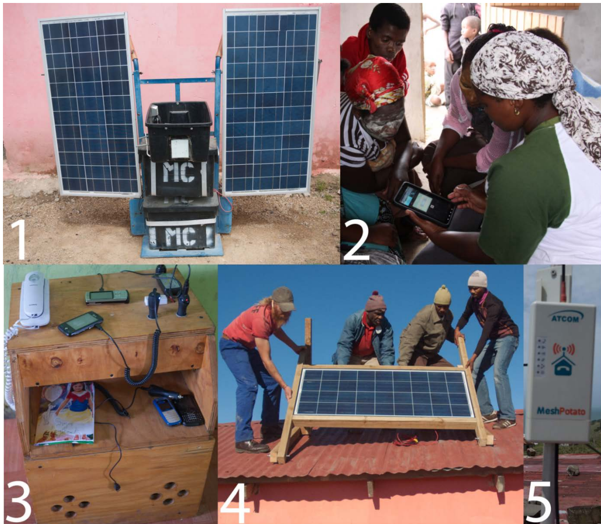
Figure 2. We trained participants to use solar cellphone Charging Stations (1) and Audio Repository (2) in workshops (upper) and to build and install wooden fixtures for the phone and charging apparatus (3) and for roof-top solar panels (4). The panels charge car batteries (in 3) to power the mesh nodes (5)