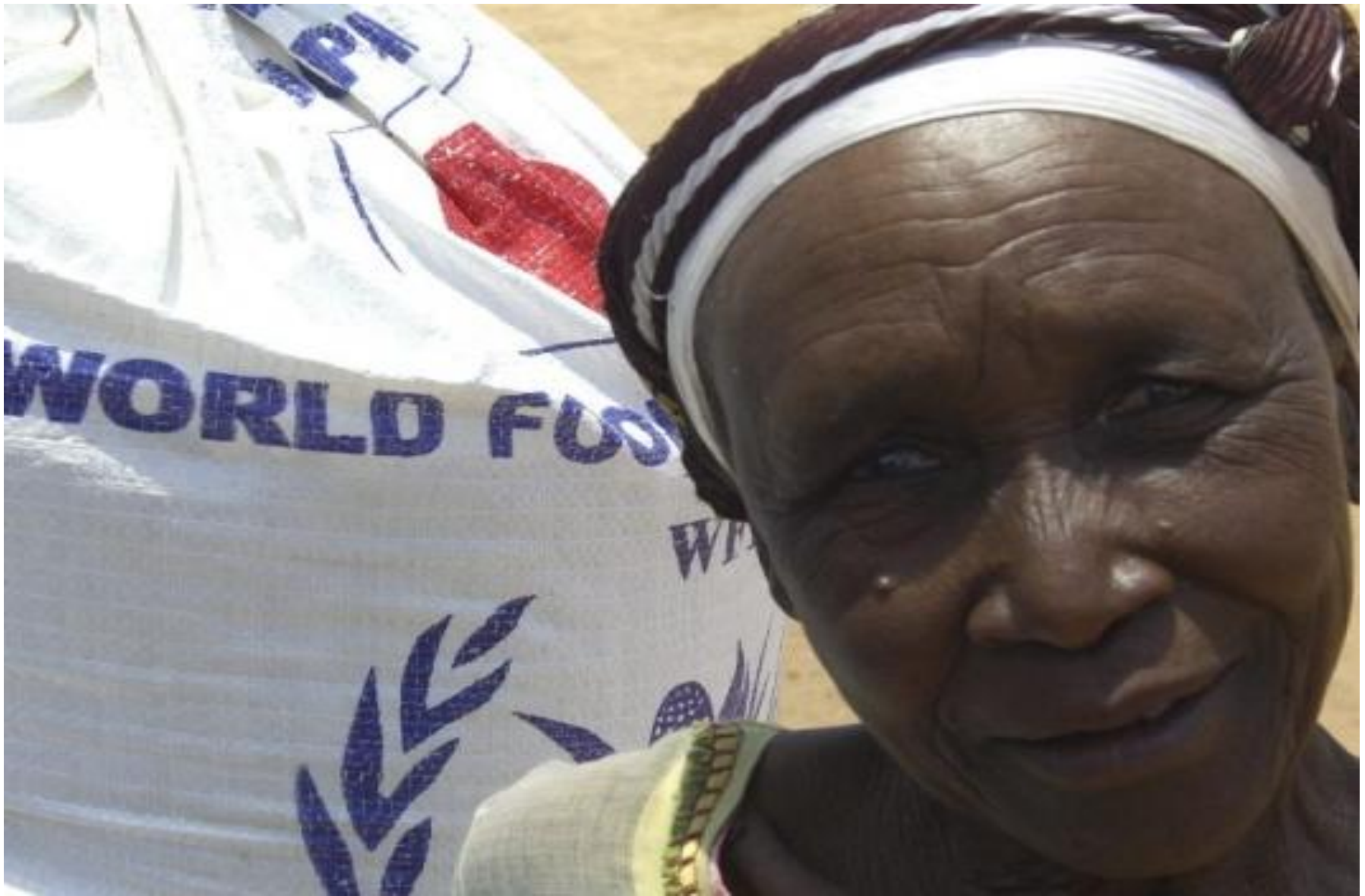
Grandmother of 5 has just received her food parcel from WFP, 2007