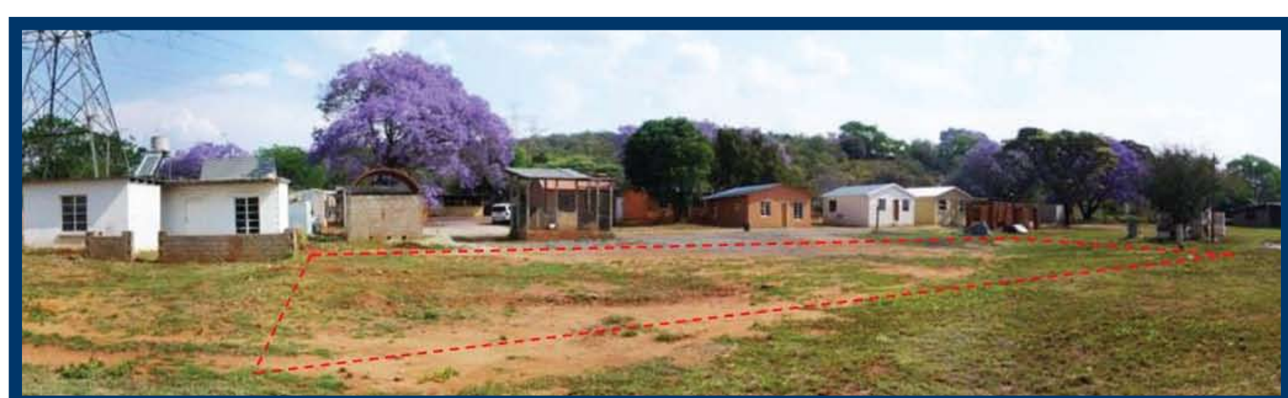
Figure 1: North-eastern view of the CSIR BE Innovation Site

The planning and preparation phase for the development of the CSIR Sanitation Technology Demonstration Centre included a literature review of other demonstration centres such as Sulabh, the Philippine Centre for water and sanitation, as well as the Ecosan Centre. Researchers looked at the demonstration of sanitation technologies internationally and the development of criteria for the selection of sanitation technology options to be constructed and the writing up of a report. Figure 1 shows an image of the site from the north-eastern view.