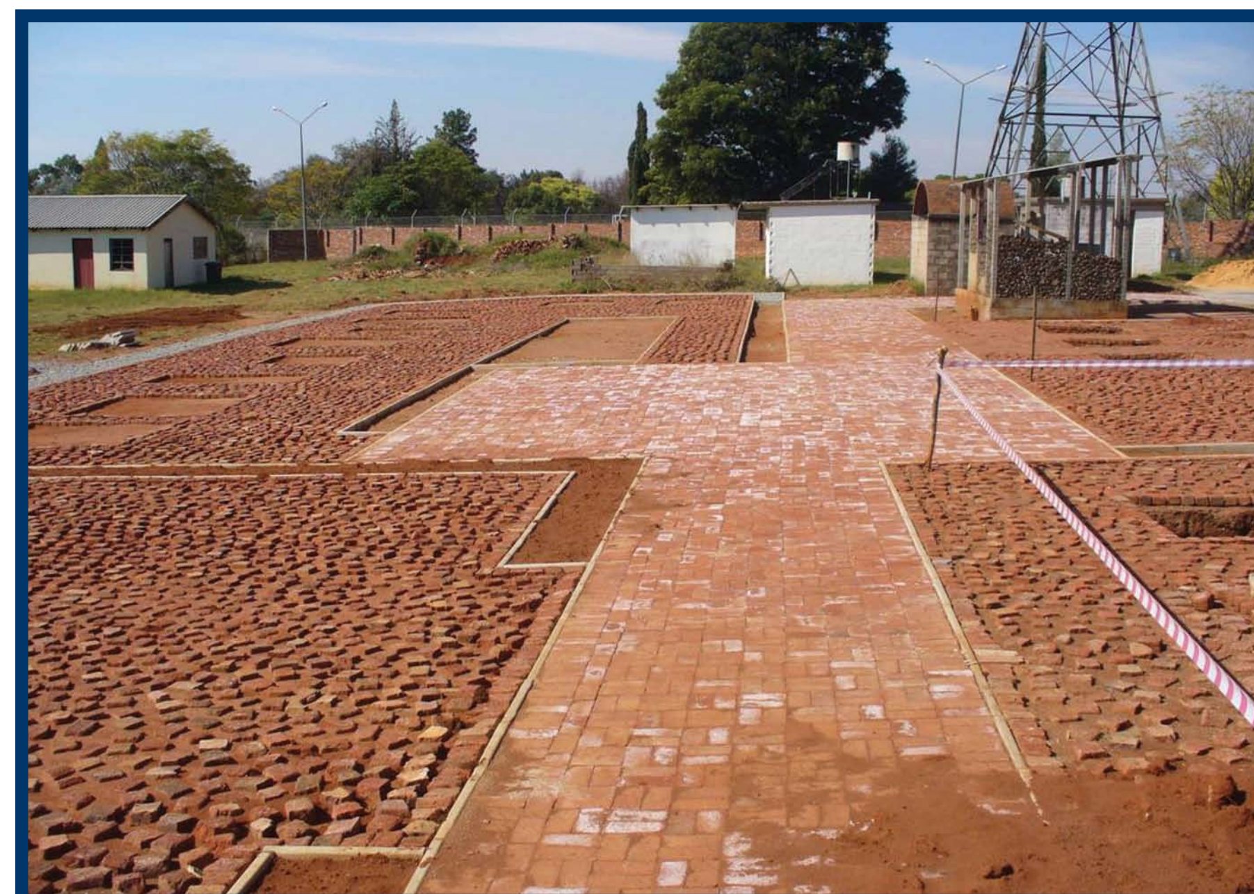
Figure 4: Western view of the facility