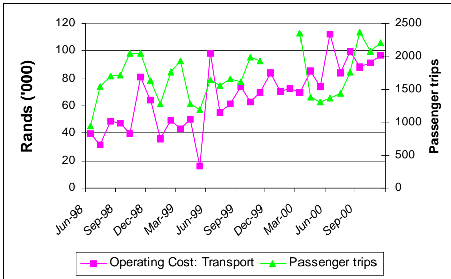
Figure 1: Transport operating costs and usage for Cape Town system