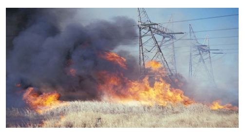
Figure 1. Grassland wildfire near transmission line

Fire can severely affect the quality of electricity supply along transmission line networks. Fires near transmission lines can cause line faults resulting in short but significant interruptions in power supply, which can have major financial implication for factories running continuous production processes (Vosloo, 2005). Eskom, South Africa's national energy generator and supplier, operates approximately 28 000 kilometres of transmission lines in South Africa, most crossing fire prone biomes. Consequently, large parts of the transmission grid are exposed to wildfires, especially during the dry winter of June-October in the north-east of the country and the hot, dry months November-March in the south-west.