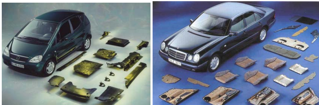
Figure 2: Different Components of Natural Fibre Reinforced Composites in Mercedes Sedan (Source: Ref. 44).