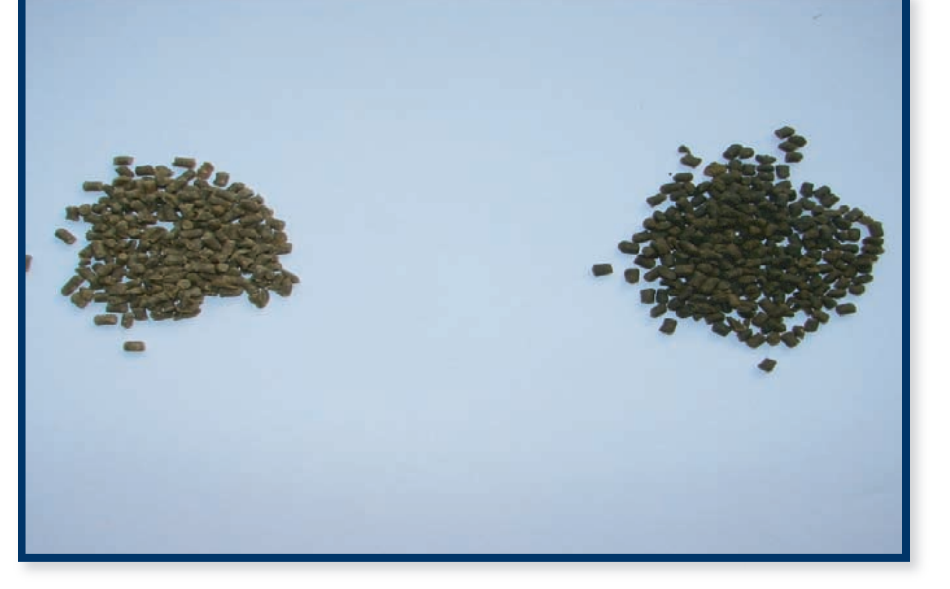
Figure 3: Examples of the feed pellets produced with brewers' spent grain for the juvenile fish feeding trial.

Highly unsaturated fatty acids (HUFA) such as eicosapentaenoic acid (EPA) are essential to regulate the immune, cardiovascular, digestive and neurological systems in mammals. These fatty acids have to be included in mammal and fish diets<sup>1</sup>. The main dietary source of HUFA is marine fish oil, but there are concerns over the sustainability of fish sources as demand for crude fish oil for the aquaculture industry increases<sup>2</sup>.