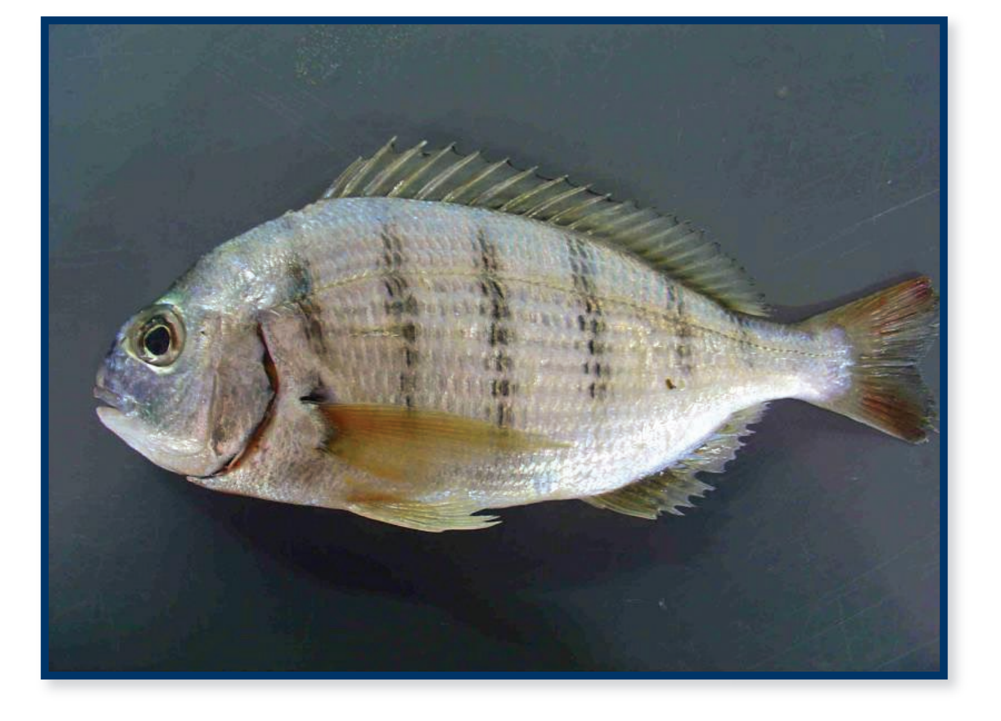
Figure 1: White stumpnose (Rhabdosargus globiceps) – one of the fish species fed on feeds containing processing by-products

<u>A. JACOBS</u>, J. REDDY CSIR Biosciences, PO Box 395, Pretoria, 0001 Email: ajacobs@csir.co.za – www.csir.co.za