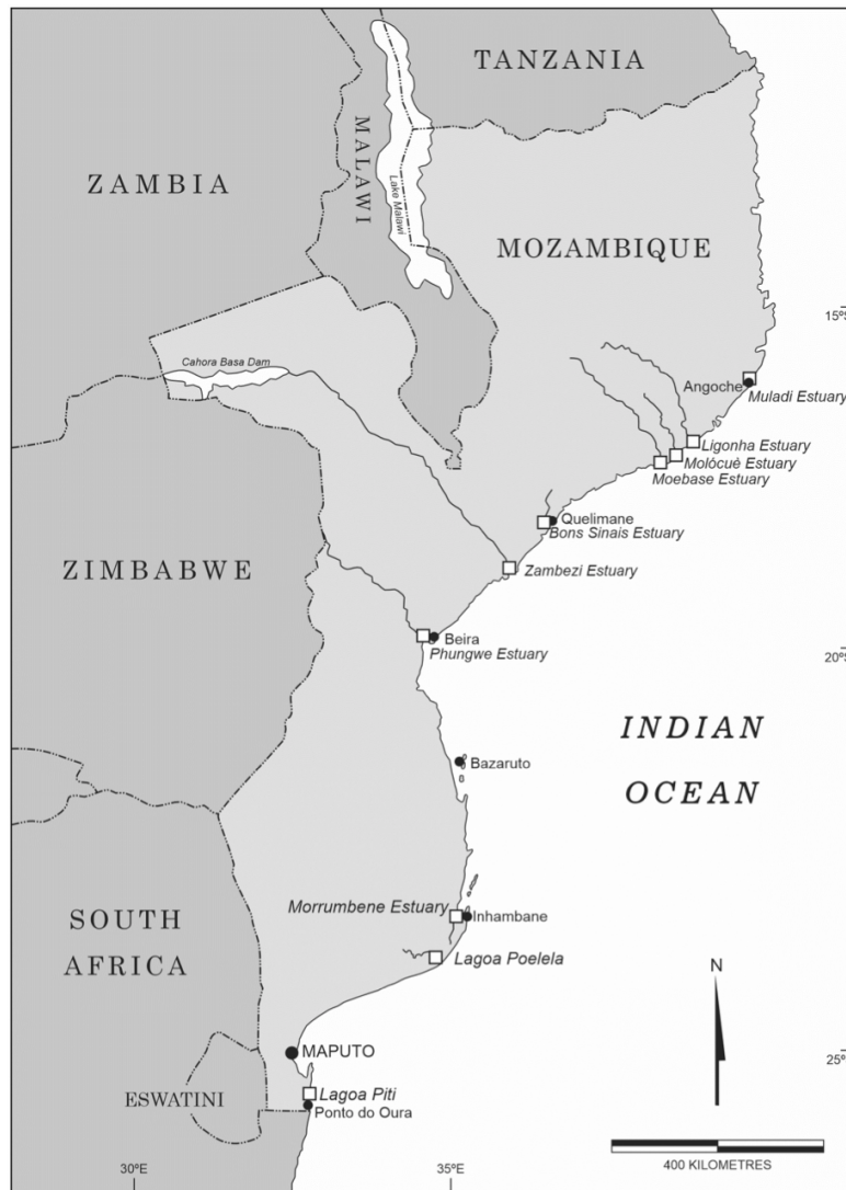
Figure 1. Map of Mozambique showing the three major coastal regions and estuarine systems mentioned in the text.

All the estuaries of Mozambique may be categorized as tropical and most belong to two main types; namely estuarine lakes and lagoons, and permanently