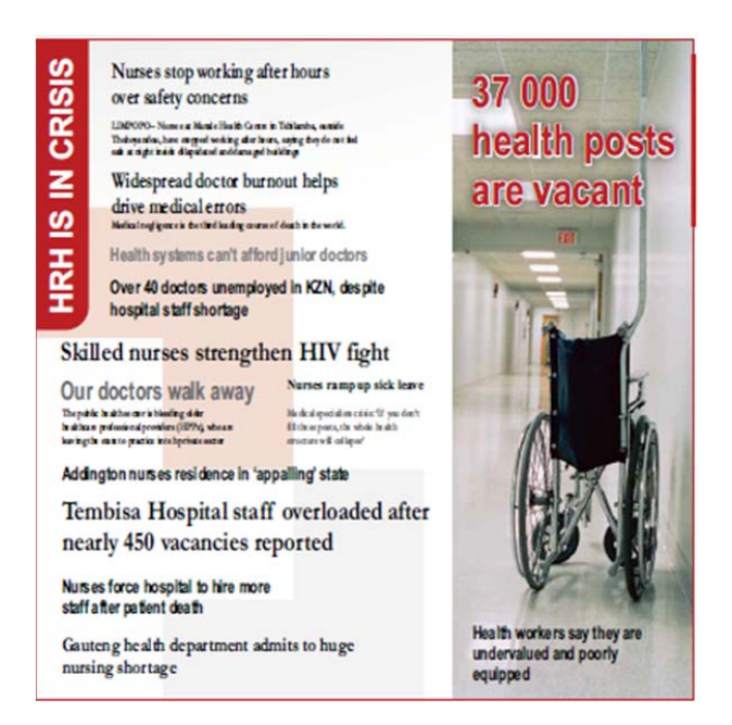
Fig. 2 Challenges Facing Human Resources for Health, adapted from [6]

The following section will give recommendations to the factors that contribute to data integrity issues and if applied can assist to manage data integrity challenges.