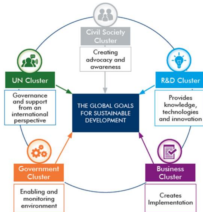
Figure 2: Diagram depicting the five actor clusters identified and detailing the key role each one has with regards to implementing the SDGs in South Africa