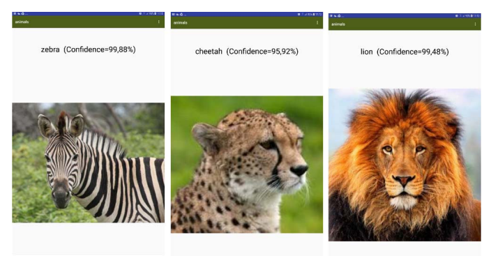
Fig 2: Android app

Three examples of the Android app recognising images can be seen in Fig. 2