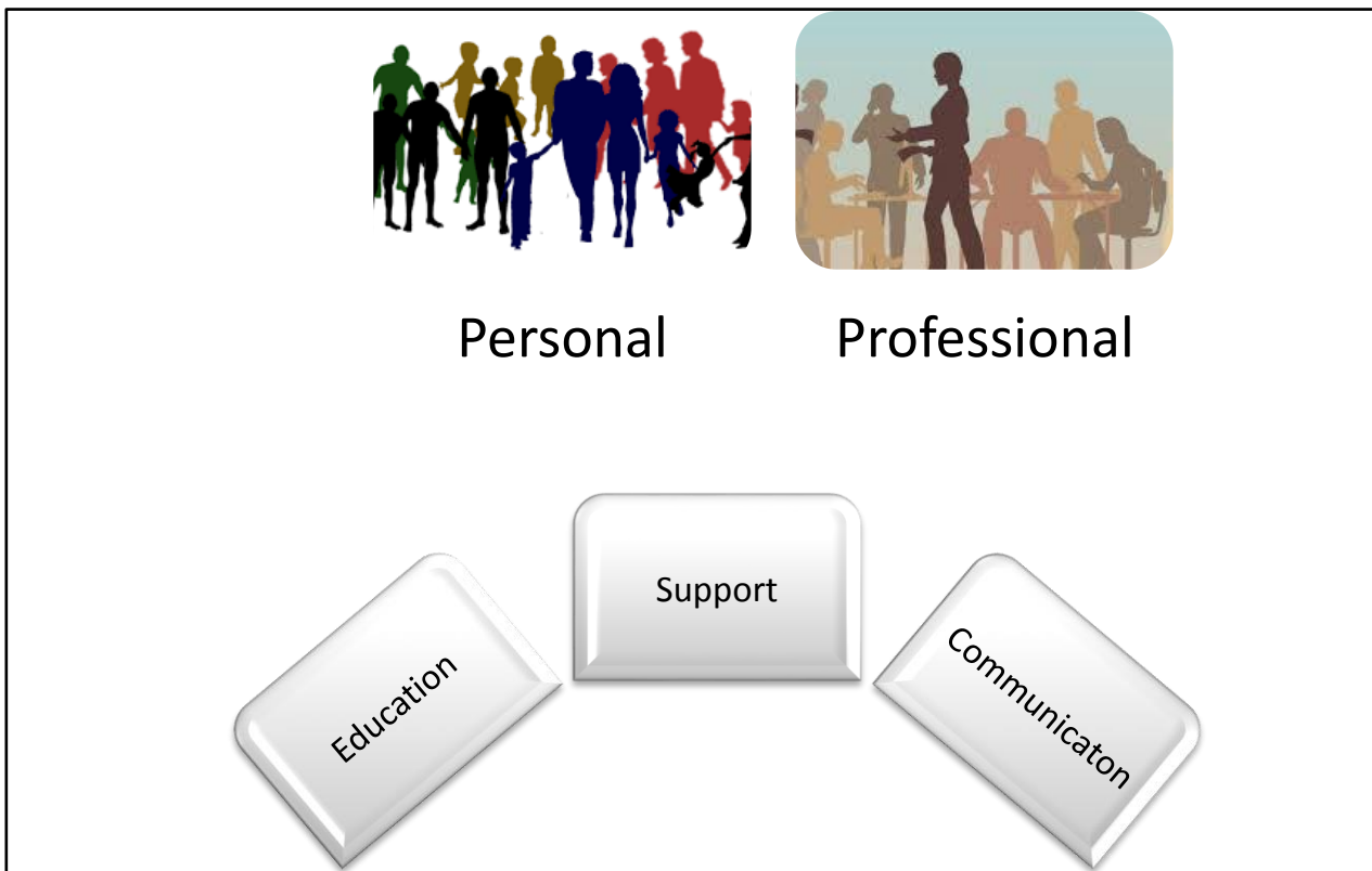
Figure 4: Differentiation between Personal and Professional Use

regards to information sharing, communication and support. Social media for command purposes can still be used to motivate and direct people into action. Social media can assist in situational awareness and understanding of the environment. Societal insights, emerging behaviours, trends, patterns of activity can all be found in social media platforms.