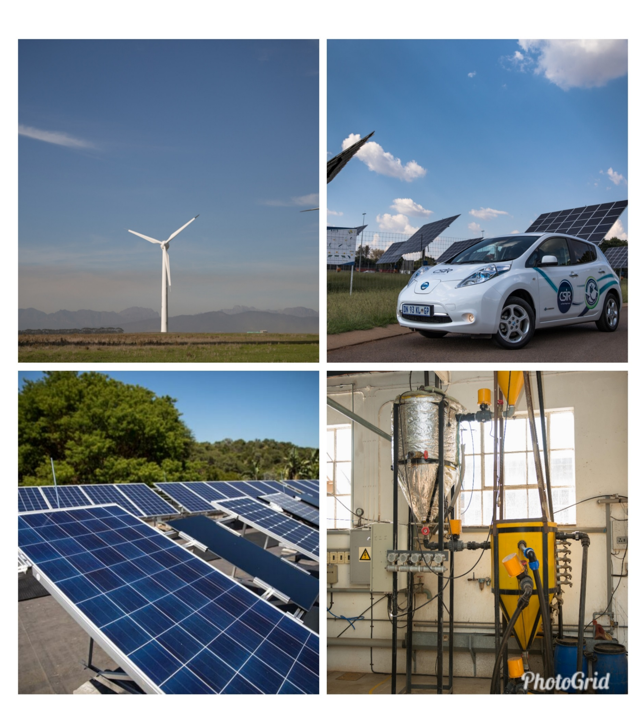
Figure 1 Renewable energy technologies

Below are some of the renewable energy technologies CSIR is involved in.