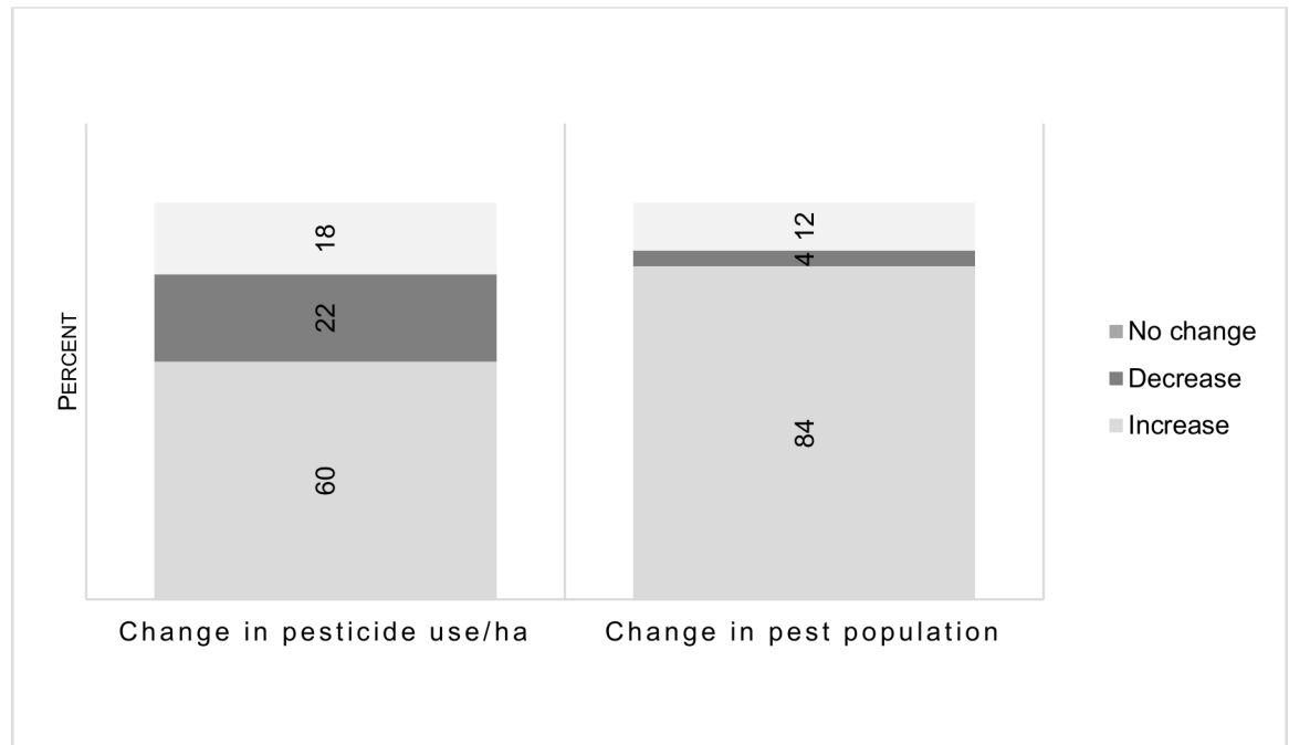
Fig 2. Influence of climate variability, perceptions and political ecology on Zimbabwe farmers' pesticide use.

https://doi.org/10.1371/journal.pone.0196901.g002